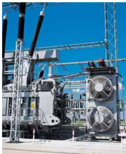
Modern transformer technology

the alternatives, or with new value-added features.