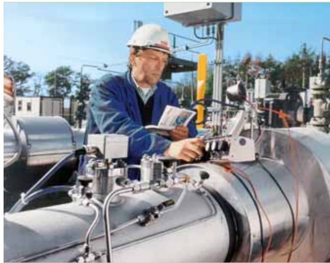
Installation of advanced instrumentation in the field

a hundred years. The concepts that underlie some of these technologies have evolved slowly: modern power transformers, for instance, work according to the same principles as they did in the early days of electric power transmission. And despite huge progress in switching technologies and material science, circuit breakers have been based on the same principles for the last fifty years. Now that small and powerful microcontrollers are available at low cost, embedded system components are finding their way into these long-established products. Here, the embedded systems typically perform a secondary function: they are used to supervise, protect or control the primary function of the product. The technology is a way of providing these attributes more cheaply, than